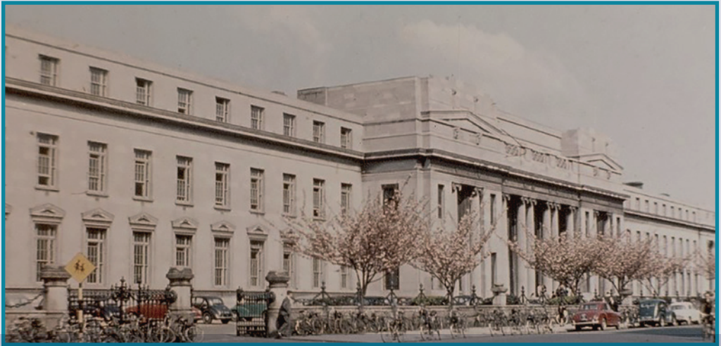
UCD Earlsfort Terrace 1962 - UCD Digital Collection

“ I am tomorrow or some future day what I establish today ”