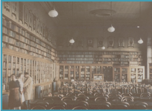
UCD Earlsfort Terrace Main Library - UCD Digital Collection