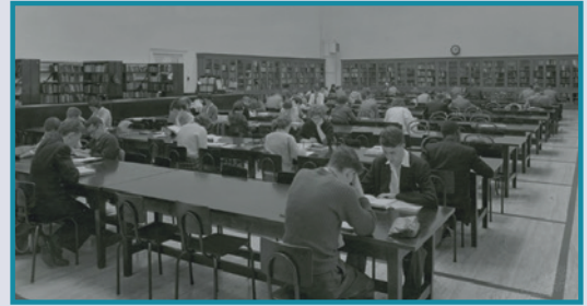
UCD Earlsfort Terrace Study Area - UCD Digital Collection